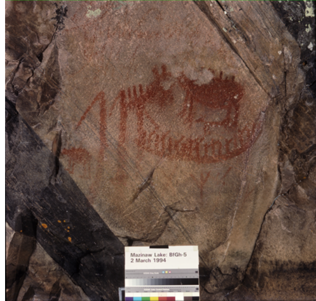
Pictograph at the Mazinaw Site

The Mazinaw Pictographs Site, within Bon Echo Provincial Park in Eastern Ontario, was designated as a national historic site in 1982 because it contained the biggest concentration of painted images on rock faces in Southern Ontario and is the most complex such site known, with its abstract and geometric symbols. The Algonquins of Pikwakanagan First Nation, at Golden Lake, have a special bond with the site and have worked with Parks Canada and with the government of Ontario to see the site protected and interpreted to the public. I met several times with Chief and Council and the staff of that First Nation's cultural centre to try to define and express what, for that community, was the heritage value of the rock art site. "Mazinaw" is an Algonquin word that means "picture" or "writing". For ancient artists, such images were indeed a way to tell a story.