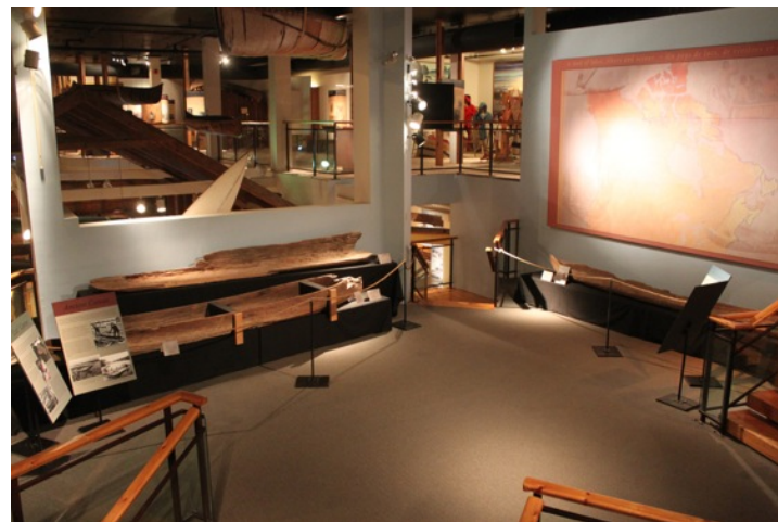
Above: photos of special display of 'lost' canoes at the Canadian Canoe Museum prepared by Jeremy Ward, the curator, for Symposium 2014