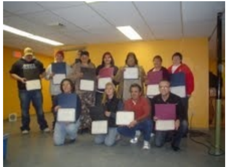
First Nation Archaeology Liaisons.