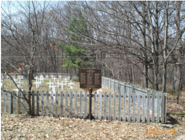
Beausoleil CEMETERY PLAQUE

Archaeologically it contains evidence of human presence and activities from Paleo-Indian times at least 9,000 years ago, up until the late 19 th century. It was a stopping place, hunting area and later home to millennia of Anishinaabe groups. The island itself is part Canadian Shield and part St. Lawrence Lowlands, showing the diversity of habitats that characterize The Land Between .