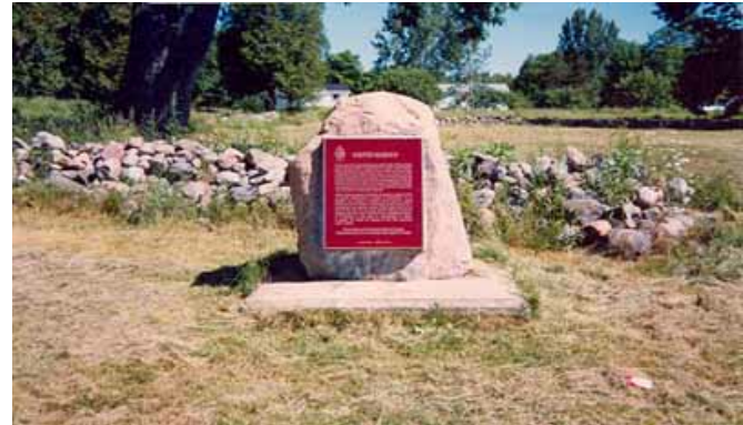
Ste. Marie II ruins

Much less well known to the public is the archaeological site of Fort Ste. Marie II on Christian Island in Georgian Bay. On the territory of the Chippewas of Beausoleil First Nation, this small site is a "ruins