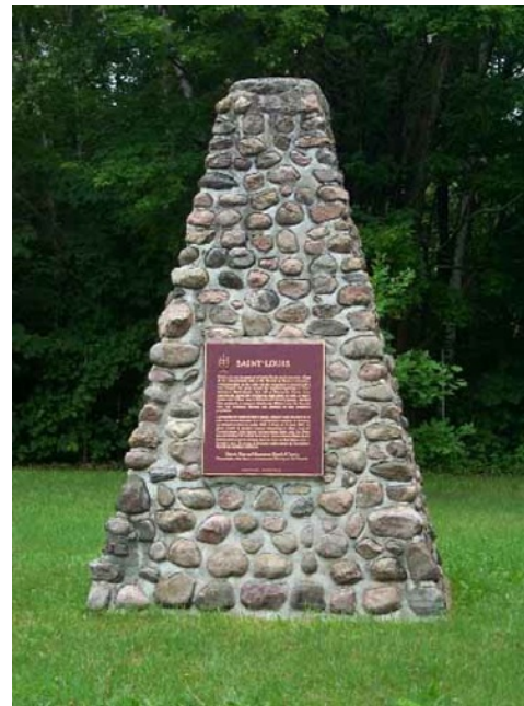
Saint-Louis Mission Cairn

While technically just west of what we call The Land Between, four nationally significant post-contact archaeological village sites in the Midland and Penetanguishene area of Georgian Bay relate to the tumultuous history of the mid-17 th century. These are Saint-Louis Mission, Fort Ste. Marie I, Fort Ste. Marie II and the Ossossané Village and Ossuary. All were designated in the early days by the HSMBC in recognition of their significance as places where the Jesuit priests recorded their lives among the Huron-Wendat people or where battles against the League Iroquois took place. Saint-Louis Mission, Forts Sainte-Marie I and II were all recognized in 1920 and the Ossossané sites were designated in 1982.