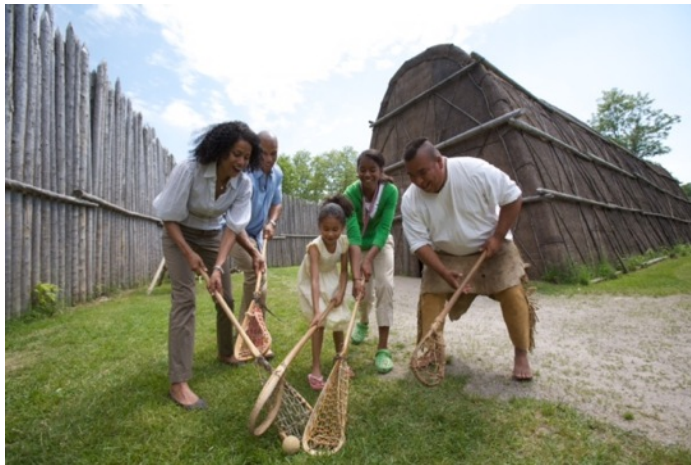
Sainte Marie Among the Hurons and lacrosse

experience" representing the wintering site of the remnant populations of Huron-Wendat people and Jesuit priests after St. Marie I was attacked and burned in 1649.