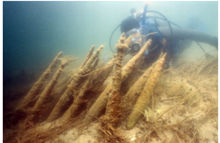
Mnjikaning, diver underwater with stakes

Today the Chippewas of Rama First Nation have a special steward relationship with the place. A non-profit multi-disciplinary group, the Mnjikaning Fish Fence Circle, with other community organizations, is working towards establishing better site access and improved public understanding about the sacredness of the weirs and the importance that the Narrows has had to Aboriginal people through time. I am privileged to sit as a director of the Circle and I cherish the many relationships that we have with people from Rama First Nation.