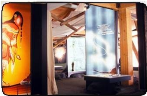
Petroglyphs Visitor Centre